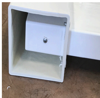
Step 5: Screw top and bottom rail into gate pockets.