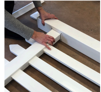
Step 3: Put top and bottom rail into both posts.