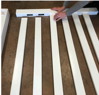
Step 1: Put Pickets into bottom rail.