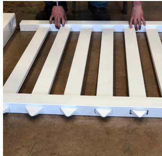
Step 2: Put Pickets into top rail.