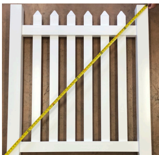
Step 4: Measure to make sure the gate is square.